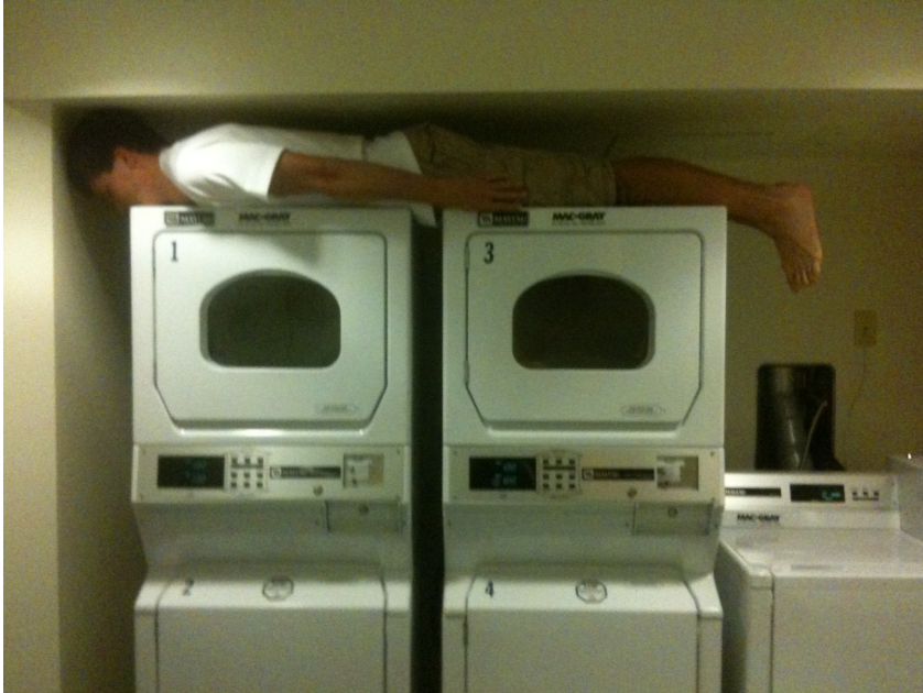
Three Communications PHDs and a dryer meet for Conference